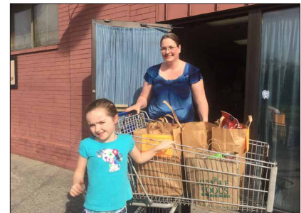
Special delivery of breakfast foods to PCC pantry from Raleigh Court Presbyterian Church