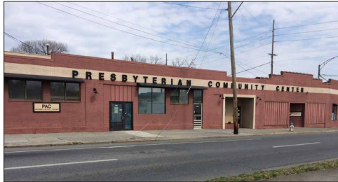
PCC on Jamison Avenue in Southeast Roanoke